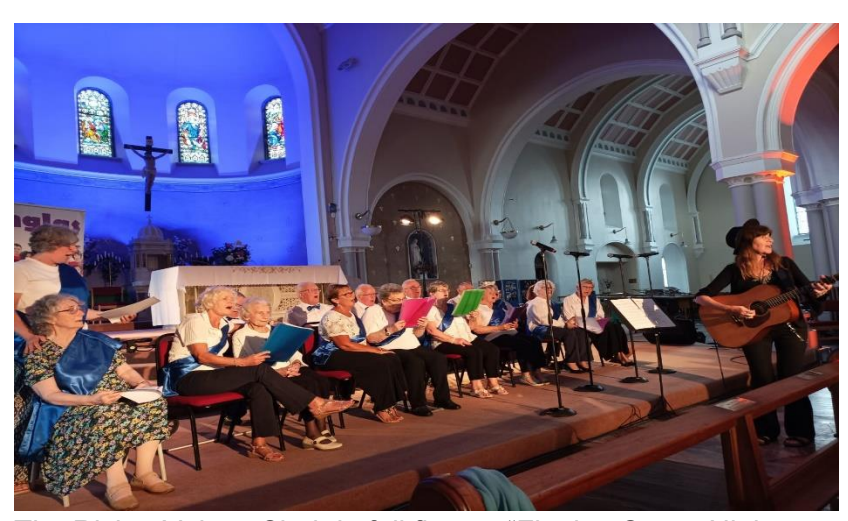
The Rising Voices Choir in full flow at "Finglas Opera Night

Dublin City Council Arts Office kindly sponsored the event and the Community Development Team in Finglas for all their work in organising the evening.